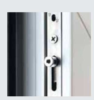
Frames can be customised to meet the highest security standards