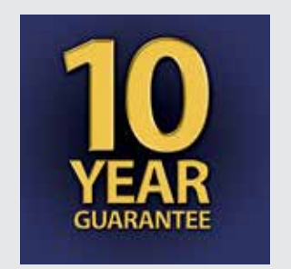
All Spectus products come with a 10 year guarantee