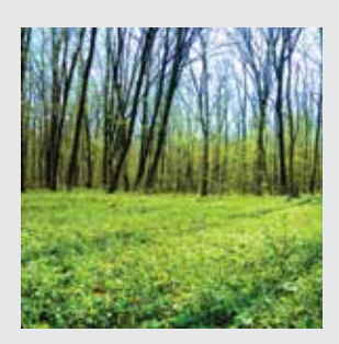
Fully committed to ISO 14001 standards covering all environmental issues